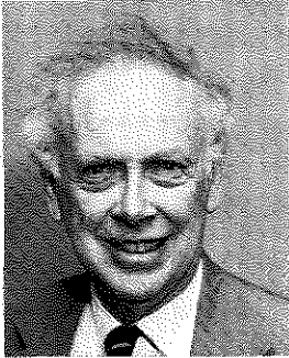
James D. Watson Director National Center for Human Genome Research